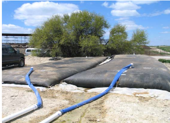
Figure 1. Partially filled Geotubes™

The Texas State Soil and Water Conservation Board, Texas Cooperative Extension, and Texas Water Resources Institute are collaborating to demonstrate and evaluate six new technologies aimed at reducing phosphorus from dairy lagoon effluent applied to waste application fields in the North Bosque and Leon River Watersheds. The two technologies evaluated in fiscal year 2005, Electrocoagulation and Geotube™ de-watering system, both appear to reduce phosphorus levels in lagoon effluent.