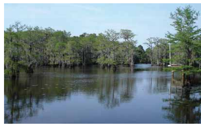
Caddo Lake's signature bald cypress trees need the high and low flow of waters for distribution and germination of their seeds.

These flow recommendations, when implemented by the Corps, will enhance the ecological structure and function of Big Cypress Creek, its floodplain and