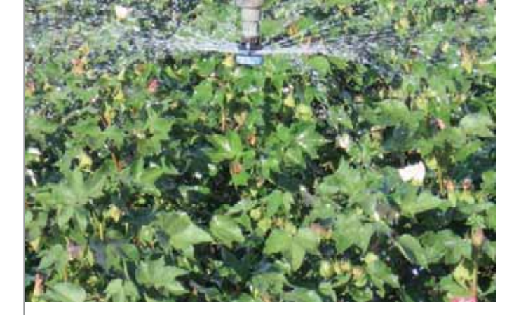
The AgriPartners demonstrations are tied to the Texas High Plains Evapotranspiration program, which provides daily information on irrigation schedules. Center pivot irrigation systems have become more efficient using the TXHPET.

Likewise, in 2004 the program conducted 44 on-farm crop and irrigation demonstrations involving seven