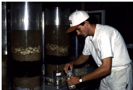
This UT student prepares a "runoff" cocktail that contains different elements that are commonly found in highway runoff. It was then applied over typical geologic surfaces found in the region in these lab studies.