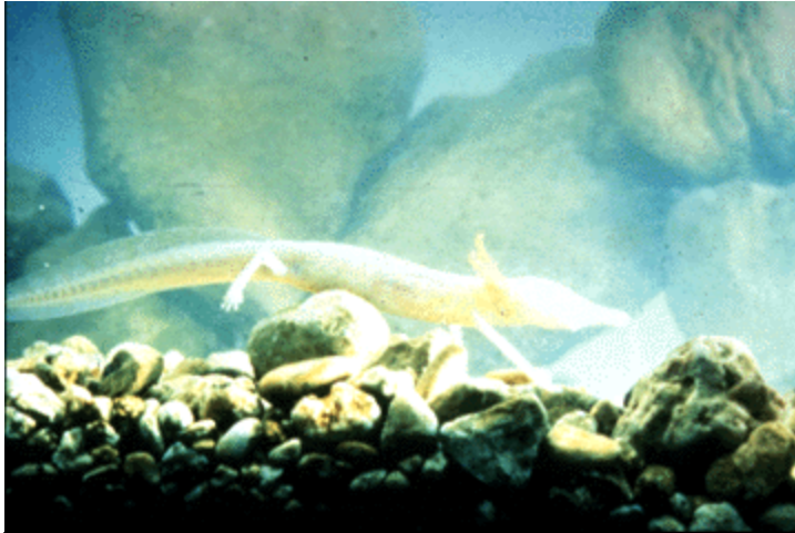
This study will help determine if springflows needed to support endangered species like this blind salamander (above) can be provided more regularly.

geochemistry of the region, biological habitats of the springs, sources of water that could be utilized for augmentation, and alternative augmentation sites and methods. This information will be used to analyze the feasibility of augmentation alternatives.