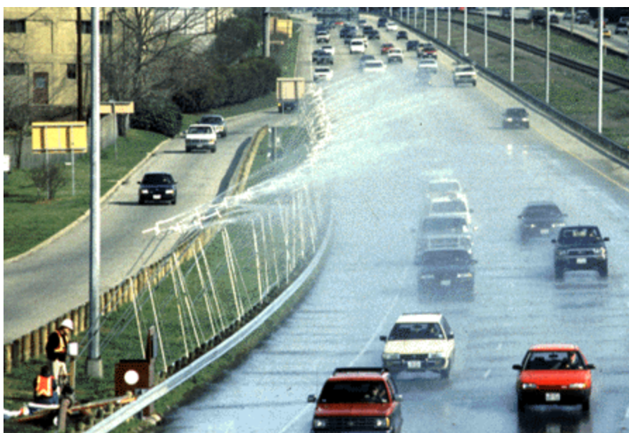
This rainfall simulator sprays precipitation onto Loop 1 in Austin. This was part of a research project at the Center for Research in Water Resources (CRWR) at UT Austin. The goal was to provide insights into the amount of pollutants carried by highway runoff and ways to treat that pollution.

The researchers hope that, by using the artificial rain maker, they can control the conditions which determine the types and amounts of pollutants (everything from oil, gas and antifreeze to metals, brake linings and