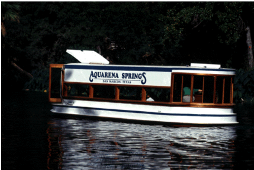
In 1993, Southwest Texas State University announced it is acquiring the Aquarena Springs resort for $6 million. The 90 acre site includes Spring Lake which is fed by San Marcos springs. The springs are important because they are home to endangered species.

the famous swimming pig perform, glass bottom boats, a gondola and observation tower, a hotel, gift shop, and two restaurants.