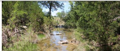
Riparian and stream ecosystem workshop , Oct. 23, Lampasas