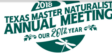
Texas Master Naturalist 2018 annual meeting , Oct. 26, Georgetown