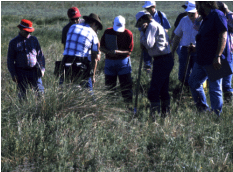
Participants in a TEEX wetlands course get extensive hands-on training on how to identify specific plants and soils.

training manual. A certificate of training will be awarded to each student that successfully completes the course and passes a written test. The course is one component of the Corps'