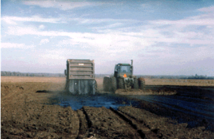
These trucks apply municipal sludge to rangelands near Sierra Blanca. Proponents say this will provide needed moisture and vegetation for West Texas deserts, while opponents argue that waste should not be imported from New York and other states.

The project involves shipping 400 dry tons of sludge daily by rail from New York City wastewater plants to a 200 square-mile ranch near Sierra Blanca in Hudspeth County. Over the next six years, the $168 million project will apply roughly 240,000 dry tons of sludge on the soil. Three dry tons of sludge would be applied per acre per day.