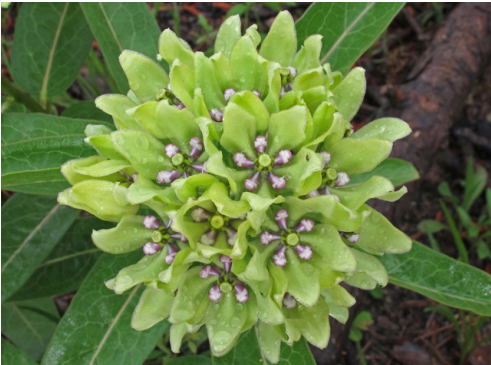
Antelope horns is one of several viable milkweeds for attracting monarch butterflies.

Mistflower, Cenizo, Turk’s Cap, Purple Passionflower, Purple Coneflower, Texas Lantana, Cross Vine, Coral Honeysuckle, Butterfly Weed, Green Milkweed, Antelope Horns