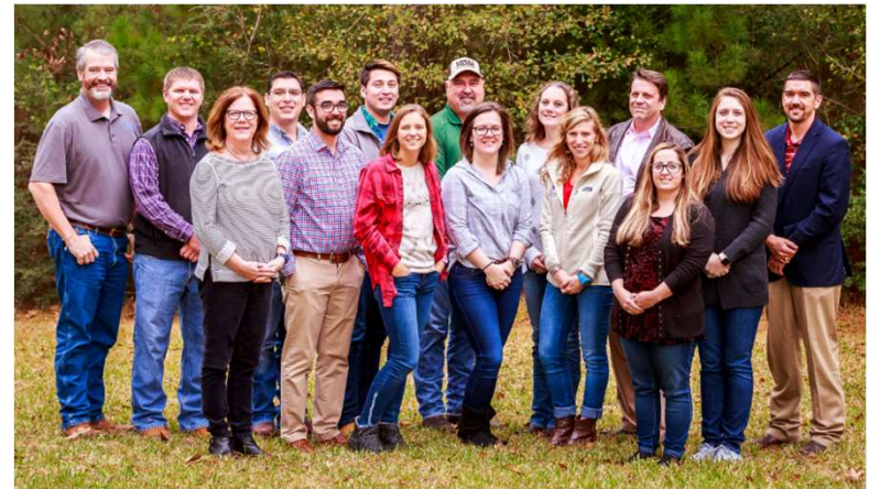
TWRI Project Areas